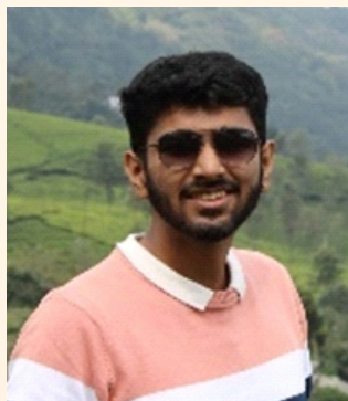
Raghav Chandak WRO0710888 Photography