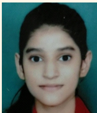
Afreen S. Khan WRO0800516 Photography