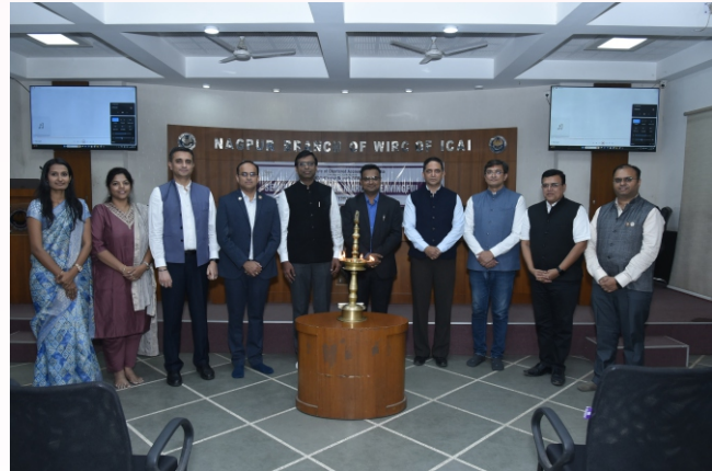
Srminar on Making March Meaning Full