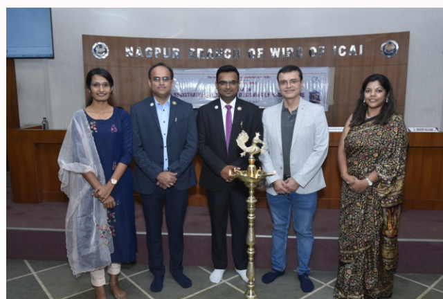
Seminar on Registration of NBFC & Understanding It's ECO System and Designing of ESOP Scheme