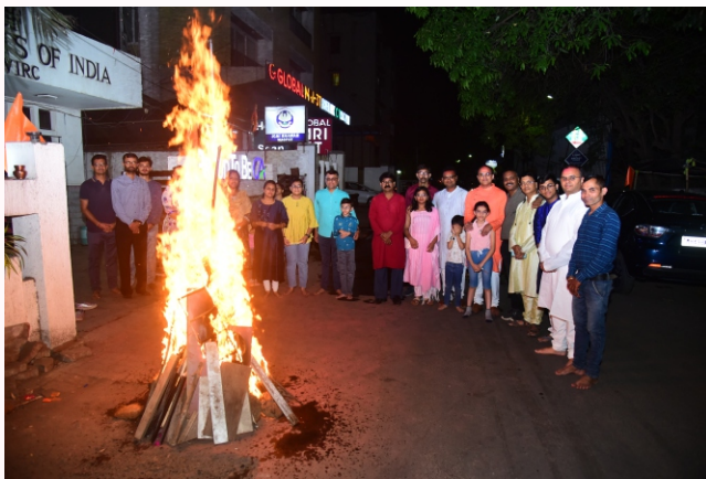
Fellowship Meet Holi Milan