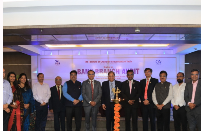
Seminar on Bank Branch Audit