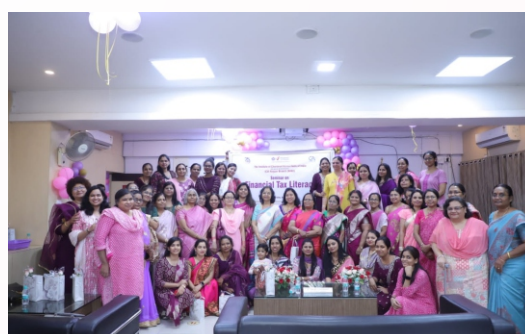
Seminar on Financial Tax Literacy