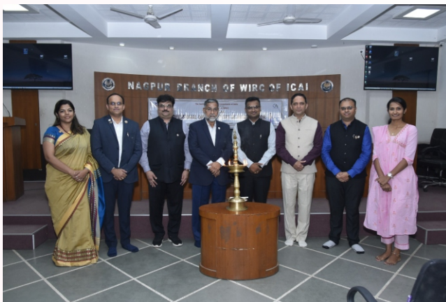
Seminar on Professional Opportunities in MSME Sector