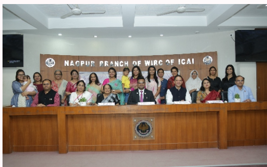
Womanifest - Celebration of International Women's Day