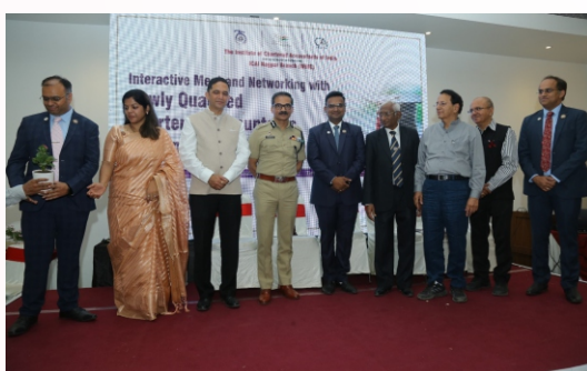
Interactive Meet with Newly Qualified CA's